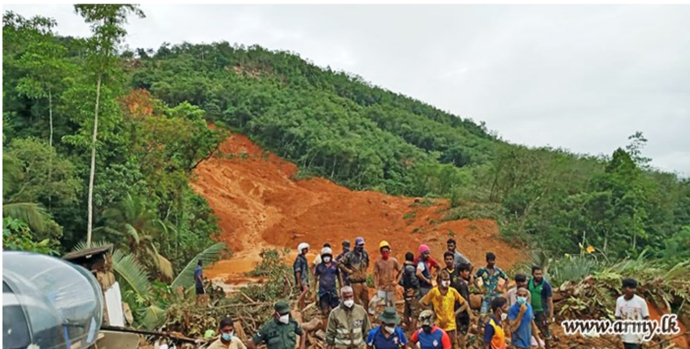
FIGURE 2: Affected families rescued by SAR teams in Dumbara, Ratnapura

This report was produced with the technical support of World Food Programme (WFP)